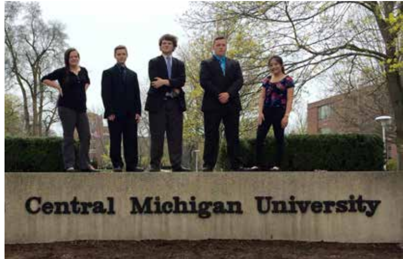
The Forensics Team at the Interscholastic Forensics Association State Tournament at CMU.