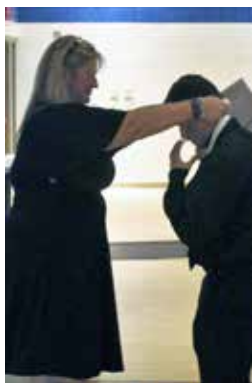
The Spirit of Austin Awards Dinner also included the senior awards ceremony.